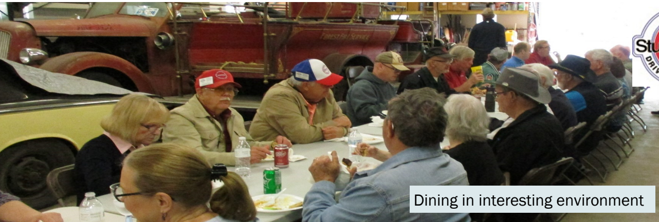
Dining in interesting environment