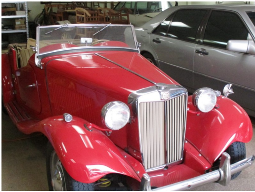
Nearly-finished MG.....MG in the process of restoration

Many projects in progress at the time we attended, all of great interest to the group. The meal perhaps the favorite?? It was great.