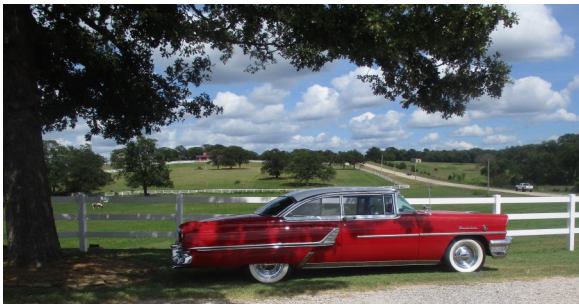
Beautiful cars, beautiful day, beautiful people...HAPPY ANNIVERSARY, PETER AND KATHY !!!