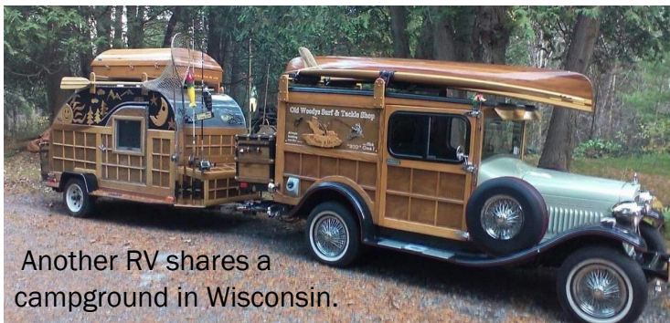
Another RV shares a campground in Wisconsin.