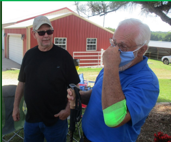
Did Ron say or do something with which Studie Pete disagreed???

What a beautiful day it was as we all enjoyed the weather, the camaraderie, the food, the drinks, the food, the drinks