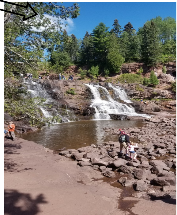
Gooseberry Falls, MN

“On the way back from Grand Marais, we had a black bear cub cross the highway ahead of us. That gave us our wildlife viewing making the journey here worthwhile. Cub was all alone and just lumbered across the highway.”