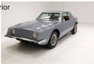
More pictures in e-mail version!